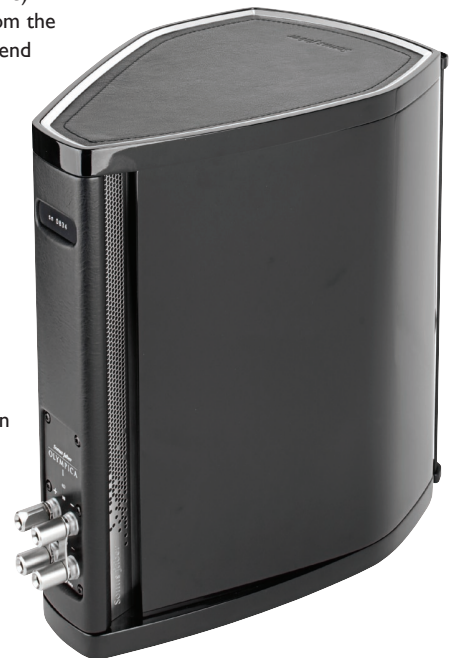
The rear of the Olympica 1s feature Sonus faber's new bass reflex port which extends down the whole of one side and is covered by a stainless steel foil.

And while there might not be sub-sonics on offer due to the size of the cabinet, the Olympicas do unearth a good deal of low frequency information. Listening to the opening