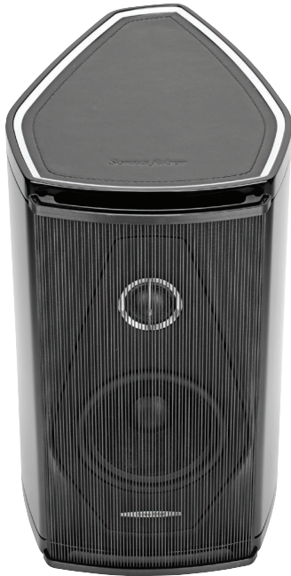
A novel grille composed of strings is a distinctive feature - as is the asymmetrical cabinet shape.

Now comes the new Olympica range comprising two floorstanders, a centre 'speaker and the standmount Olympica I on review here. These are Sonus faber's middle range – standing above the Veneres and below the Homage Tradition series with all production taking place in Italy.