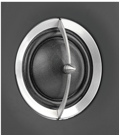
The large 29mm silk dome tweeter uses a wave guide for optimal sound dispersion.

As you'd expect from Sonus faber the Olympicas are a striking-looking loudspeaker, the lyre-shaped cabinet being constructed from walnut wood allied to a sculpted, leather-covered front baffle. It's also asymmetrical with one side being slightly deeper than the other. There's two reasons for this – first the shape